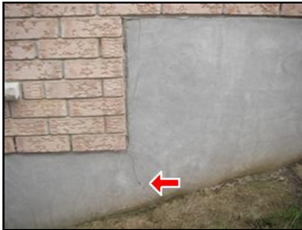
2.1 Picture 2

(2) Typical cracks noted in the foundation wall: Normal shrinkage in the concrete, stress of temperature differences between the inside and outside and between buried and exposed parts of the foundation cause a certain amount of minor cracking, especially in the first year or two following construction. Cracks noted are small, dry and could be considered typical. No action required unless moisture entry into basement is observed.