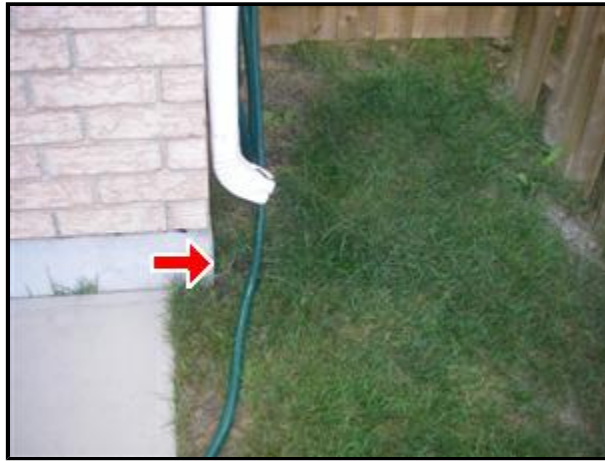
3.3 Picture 2

(2) Down spouts draining roof water beside the foundation. Recommend installing down spout extensions or splash pads as needed to ensure roof water is draining away from the foundation effectively.