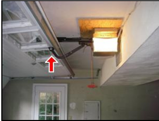
1.4 Picture 1

1.5 Wood steps from deck sitting directly on soil. Wood soil contact may cause wood rot/settlement and premature deterioration of stairway. Recommend setting wood stringers on patio stone to prevent/reduce wood deterioration.