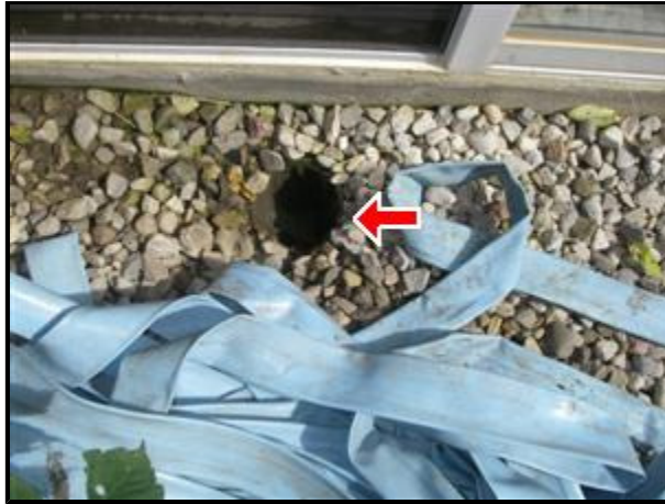
1.6 Picture 2

The exterior of the home was inspected and reported on with the above information. While the inspector makes every effort to find all areas of concern, some areas can go unnoticed. Please be aware that the inspector has your best interest in mind. Any repair items mentioned in this report should be considered before purchase. It is recommended that qualified contractors be used in your further inspection or repair issues as it relates to the comments in this inspection report.