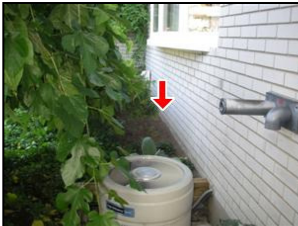
1.6 Picture 1

1.6 (1) Soil is against the brick at the back side of the house. Recommend grading improvements to provide space between soil and first row of bricks to prevent moisture entry into the building envelop (ie. remove soil/mulch while providing slope away from foundation wall).