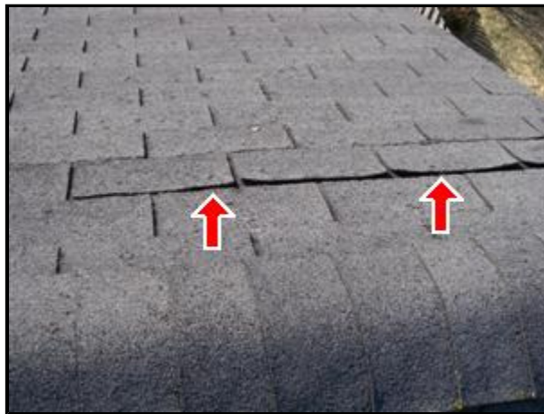
3.0 Picture 1

3.0 Roof covering is showing signs of age and deterioration. Shingles split in approximately 4 locations, immediate repairs needed in these areas to prevent moisture entry into attic space. Budget for removal and replacement of shingles (complete roof covering) with the next 1 - 2 years.