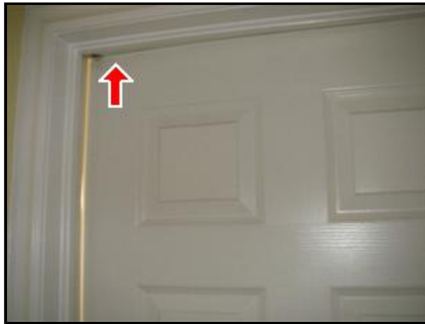
8.5 Picture 1

8.5 Tight fitting bedroom door - trim door for improved opening and closing.