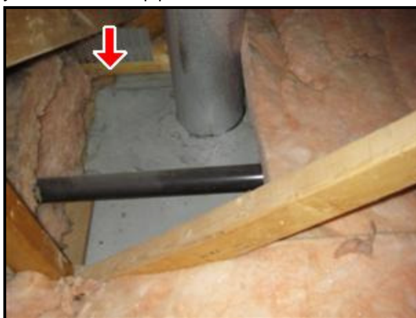
9.0 Picture 1

9.0 Attic insulation pulled away from metal flue pipe. Re-install insulation in this small area to reduce heat loss.