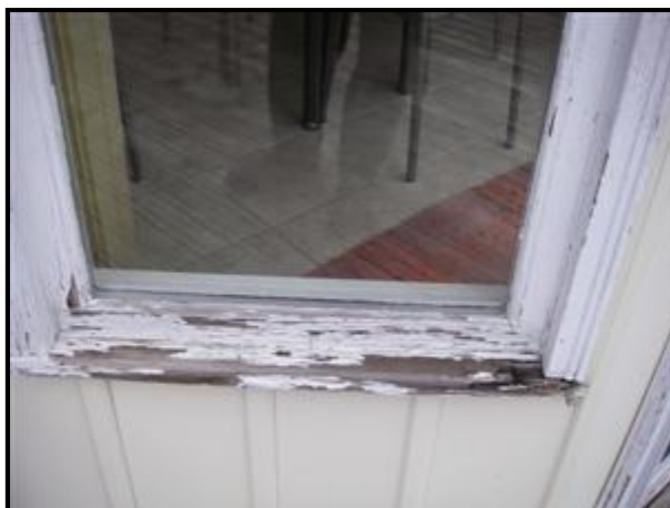
1.3 Picture 1

1.3 (1) Wood rot/deterioration noted on main level wood framed windows. Immediate maintenance needed to prevent moisture entry into building envelop (seal openings with caulking, paint wood frames, consider capping with aluminum) Consider window upgrade including full frame replacement.