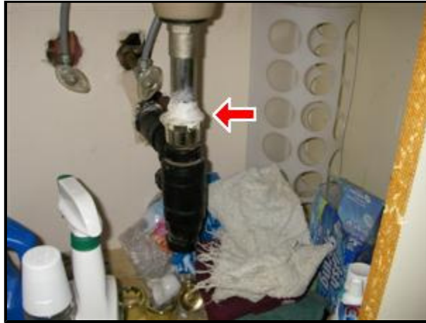
4.1 Picture 1

4.2 The use of plastic venting systems on gas fired water heaters has been amended. CSA B149.1 Natural Gas and Propane Installation Code was amended to require all plastic venting materials to be certified to the ULC S636 standard. Venting upgrades will be required at time of hot water exhaust repair or hot water tank upgrade. Up-grading venting may cause damage to finished ceiling surfaces between furnace utility room and exterior wall of house.