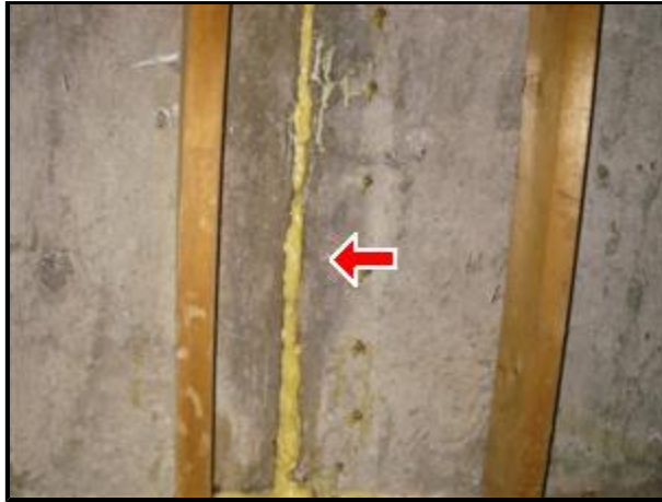
2.1 Picture 1

(2) Typical cracks noted in the foundation wall: Normal shrinkage in the concrete, stress of temperature differences between the inside and outside and between buried and exposed parts of the foundation cause a certain amount of minor cracking, especially in the first year or two following construction. Cracks noted are small, dry and could be considered typical. No action required unless moisture entry into basement is observed.