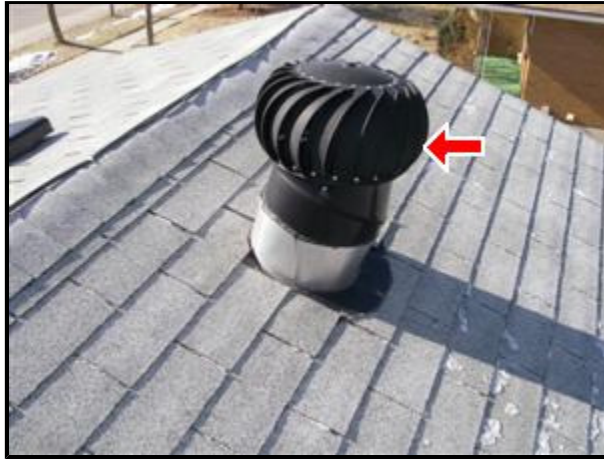
9.1 Picture 1

The insulation and ventilation of the home was inspected and reported on with the above information. While the inspector makes every effort to find all areas of concern, some areas can go unnoticed. Venting of exhaust fans or clothes dryer cannot be fully inspected and bends or obstructions can occur without being accessible or visible (behind wall and ceiling coverings). Only insulation that is visible was inspected. Please be aware that the inspector has your best interest in mind. Any repair items mentioned in this report should be considered before purchase. It is recommended that qualified contractors be used in your further inspection or repair issues as it relates to the comments in this inspection report.