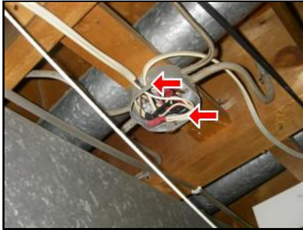
5.4 Picture 1

5.6 (1) Smoke detector missing in the basement. Smoke detectors are required on each level of the home.