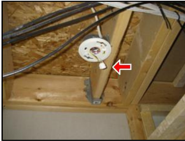
5.6 Picture 1

5.6 (1) Smoke detector missing in the basement. Smoke detectors are required on each level of the home.