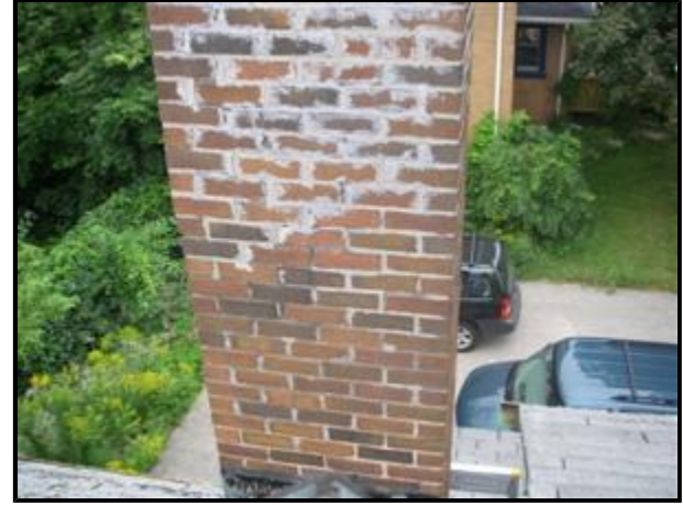
6.3 Picture 2

(2) The use of plastic venting systems on gas high efficiency furnaces has been amended. CSA B149.1 Natural Gas and Propane Installation Code was amended to require all plastic venting materials to be certified to the ULC S636 standard.