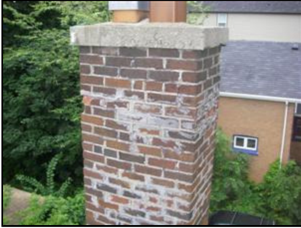
6.3 Picture 1

and should be removed (currently not in use).